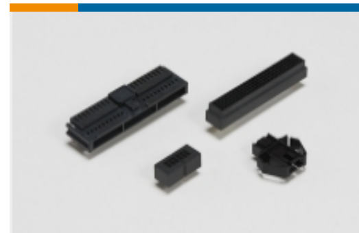
PCB Connector Shrouds(39)