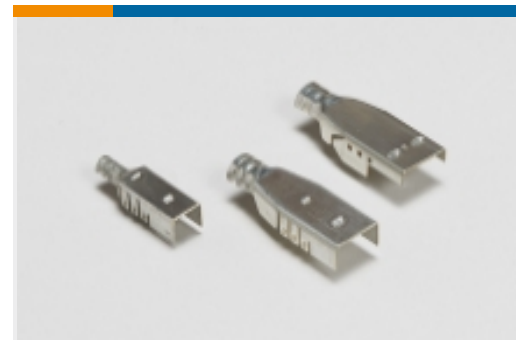
PCB Ferrules &amp; Shields(19)